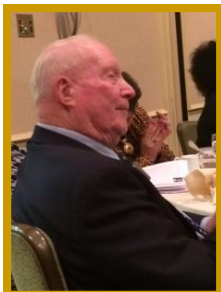
Photos from the 2015 Vikings of Distinction Banquet